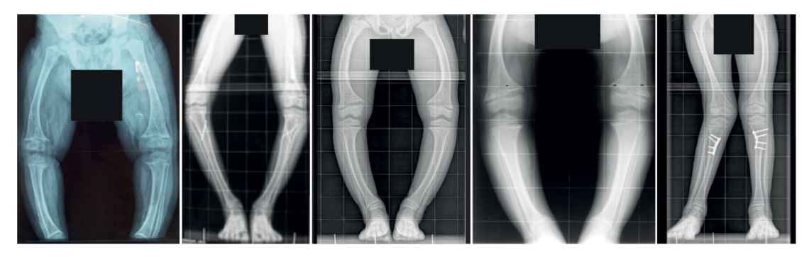
Fig. 2 | Radiographs of the lower extremities of children affected with X-linked hypophosphataemia. The patients show disproportionate short stature with genu varum (bowed legs). The final panel on the right shows a patient with a windswept deformity (characterized by a valgus deformity in one knee in association with a varus deformity in the other knee). The radiographs reveal severe leg bowing, partial fraying and irregularity of the distal femoral and proximal tibial growth plates. Note the lack of bone resorption features.

The latter might be the result of either primary tubular defects or high levels of circulating FGF23 (REFS<sup>66-68</sup>) (FIG. 3; TABLE 2). Extended molecular genetic analysis can be helpful to establish the diagnosis in unclear cases of hypophosphataemic rickets<sup>69-71</sup>. Nutritional rickets and XLH might sometimes coexist, and diagnosis of XLH should be considered in someone otherwise thought to be vitamin D or calcium deficient if serum levels of phosphate do not improve after supplementation.